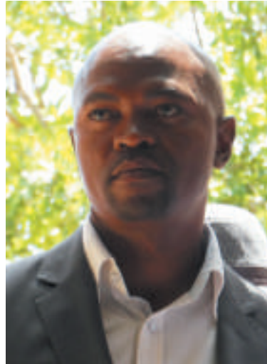
By: Vusi Dakie