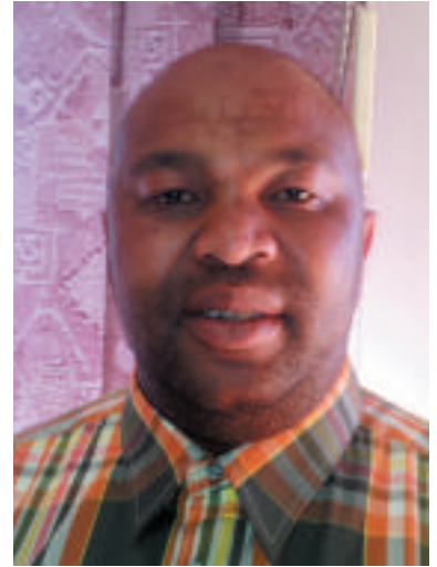
By: Thami Mgudlwa