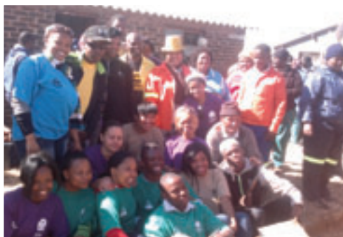
Executive Mayor of ELM & the Chief Whip with the students from NWU