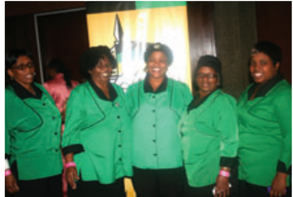
Members of the Women's League had their moment of flame celebration