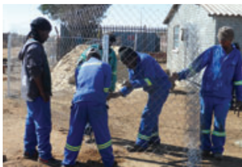
Facilities Department was also dirty at work