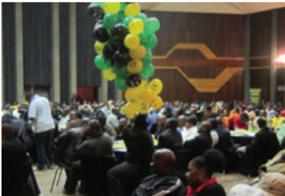
Members of ANC