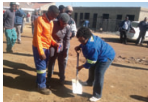
MMC of Infrastructure hard at work