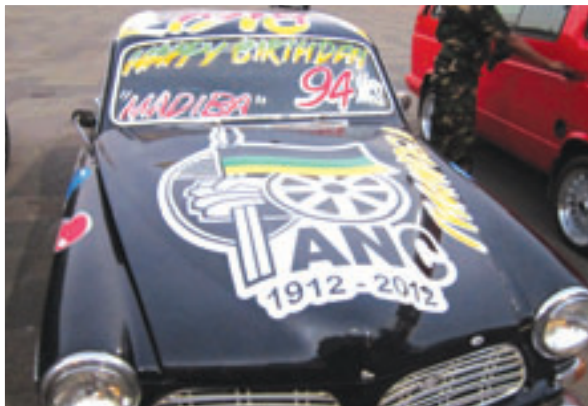
The owner of this car had two things to celebrate