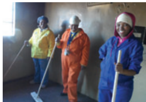
Officials from office of the Chief Whip