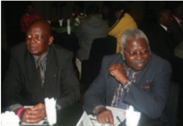
Members of the Veterans League