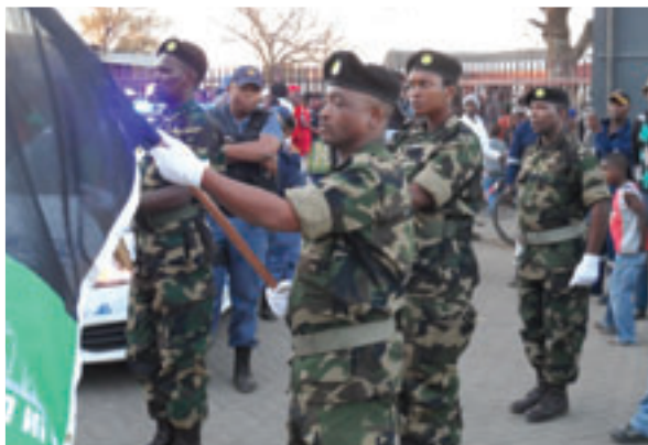
Left and right picture: Members of MKMVA leading the proceedings of the flame