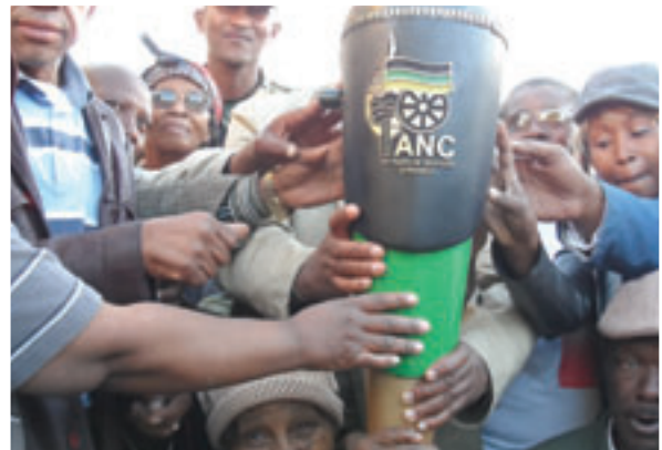
Members of the community were all smiles after touching the flame