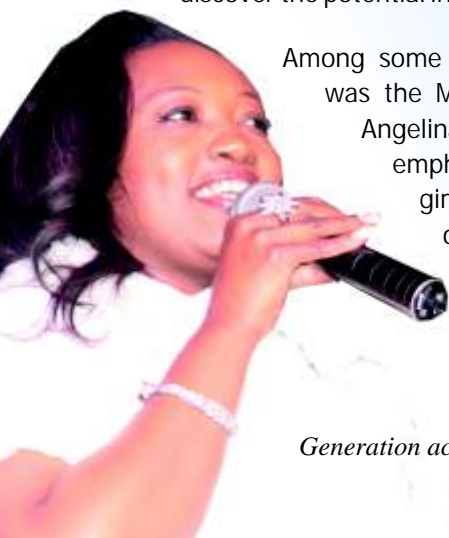
Generation actress, Sophie Ndaba

The event was concluded by having entertainment in the form of Jazeel Brothers. They did not disappoint as they brought down the house with musical prowess. They kept young and old dancing throughout the night, especially with the fan favourite song: "Ngeke ngize ngiphinde".