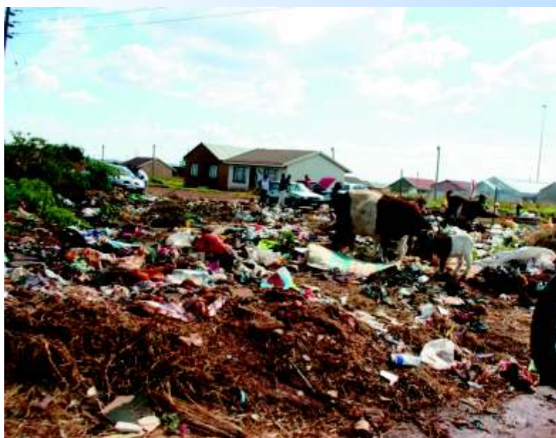
Above: Emfuleni residents must change their habits of dumping rubbish in every space available

At this point the Department of Waste does not have any means to separate the waste from the shredded waste, the assistance of the residents is requested to leave the green waste with the minimum of pollution. At all sites, there will be bins available to dispose of unwanted refuse. For information residents can contact Waste Management Department at (016) 986 8445.