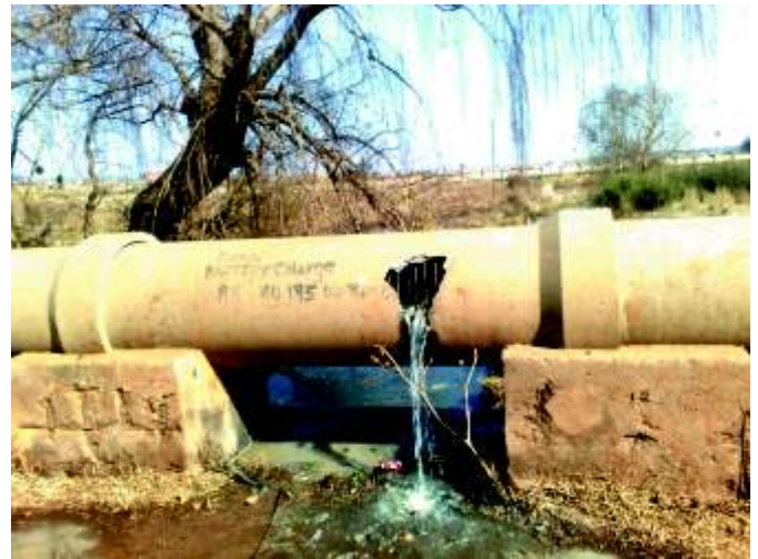
Above: Vandals punctured holes in the sides of the pipe and raw sewerage came out polluting the Rietspruit River in Evaton.