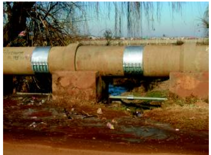
Above: The pipe after the quick response of the Metsi-A-Lekoa Maintenance Team.